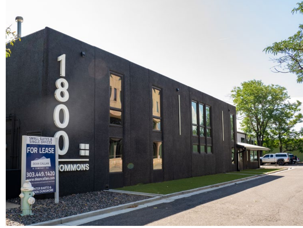
All information furnished regarding this property is obtained from sources deemed reliable. Dean Callan & Company, Inc. makes no representation, guarantee or warranty, expressed or implied, as to the accuracy thereof.

DEAN CALLAN & COMPANY, INC. 1510 28th Street, Suite 200 Boulder, Colorado 80303 303.449.1420 | www.deancallan.com